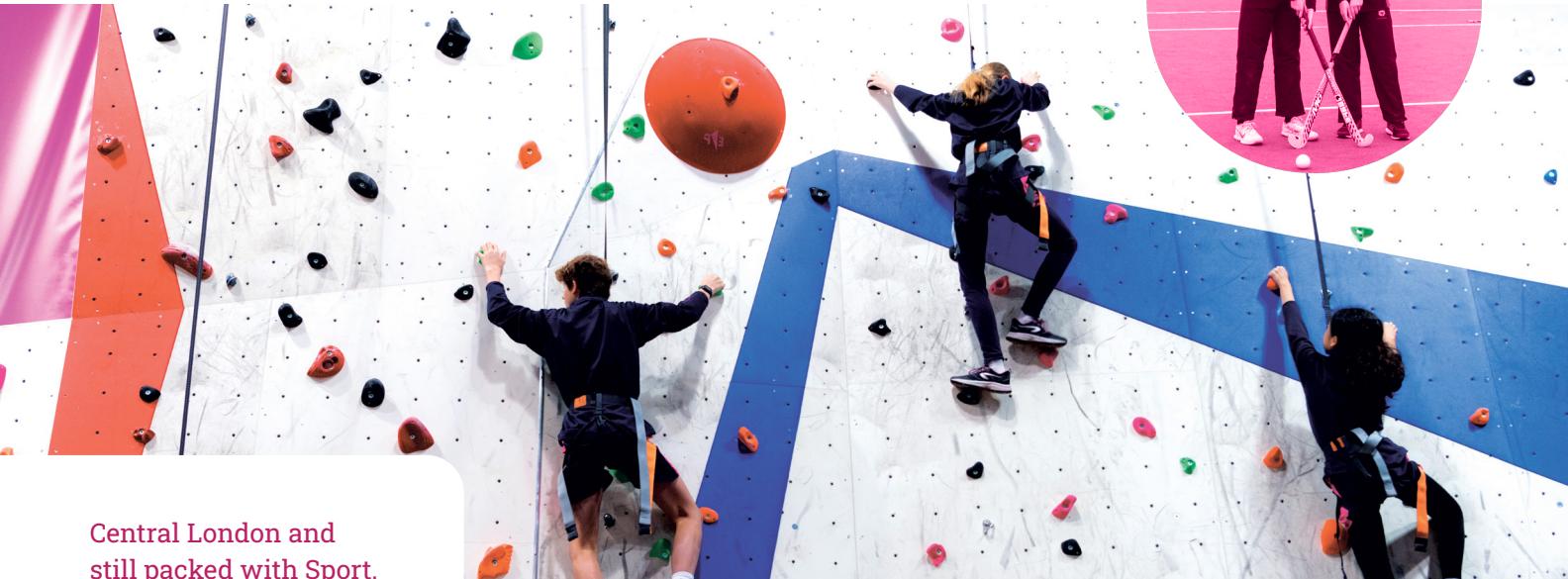
Central London and still packed with Sport.

There are two types of teenagers when it comes to Sport; those who would gladly spend all day running around, and those who desperately need it for a boost of energy. Happily, our Sports department are expert coaches who instil a love of Sport in all our pupils, by teaching pupils not just how to play a game, but how to develop a winning mindset.