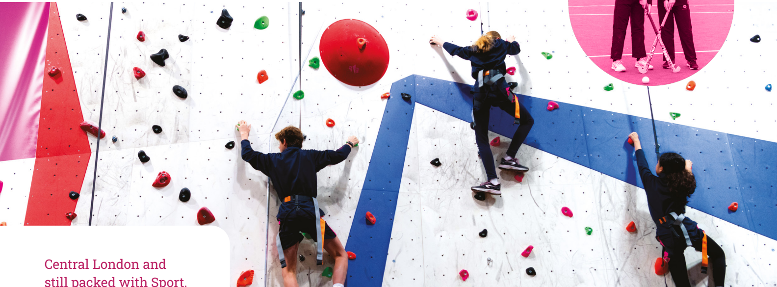
Central London and still packed with Sport.

There are two types of teenagers when it comes to Sport; those who would gladly spend all day running around, and those who desperately need it for a boost of energy. Happily, our Sports department are expert coaches who instil a love of Sport in all our pupils, by teaching pupils not just how to play a game, but how to develop a winning mindset.